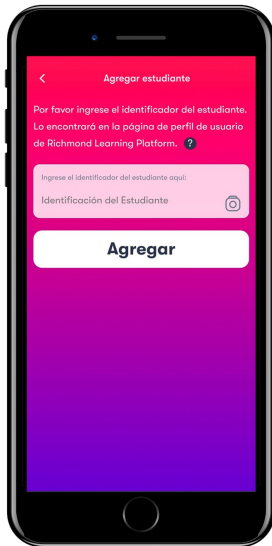
Enter the students' ID view